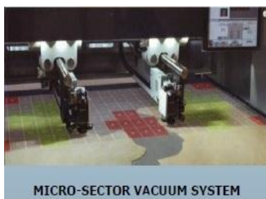
MICRO-SECTOR VACUUM SYSTEM